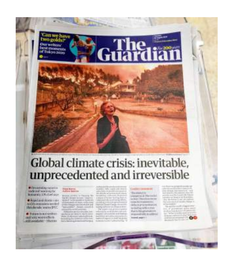
Irreversible but we can limit future damage.

Pressing ahead with the expensive and environmentally damaging HS2 project.